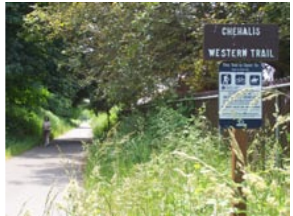
DNR's Chehalis Western Trail offers opportunities for hikers, bikers, and horseback riders.

Description: The portion of the Chehalis Western Trail (CWT) managed by the DNR was one of the first shared-use trails developed in Thurston County. This north-south 10-foot wide paved shared-use trail stretches from the Woodard Bay Preserve to Martin Way, passing through mature coniferous forest, semi-forested cattle pastures and suburban residential neighborhoods. This segment of the CWT is presently disconnected from the southern segment of the trail at Martin Way. The Bridging the Gap Project (see Map 2) aims to join these 2 corridors into one continuous north-south trail.