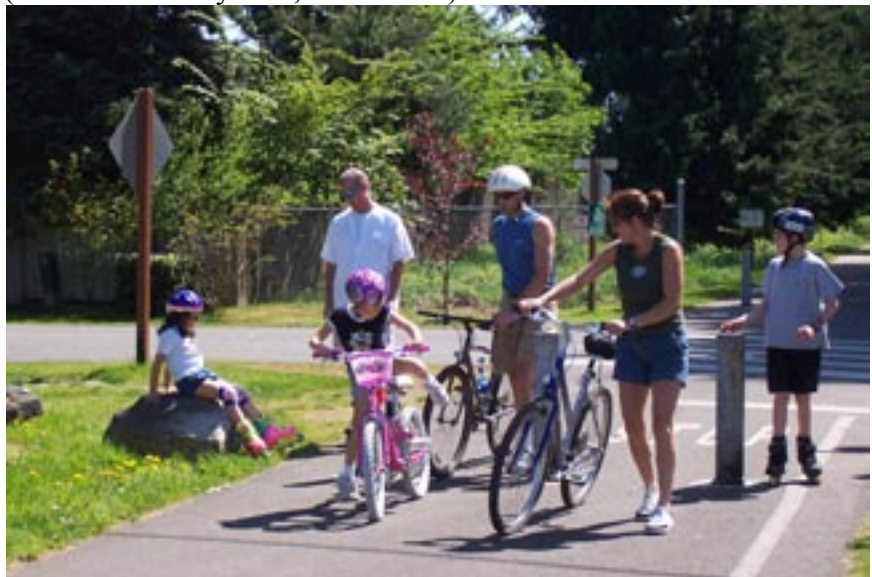
Family Fun and Physical Activity: Thurston County's Chehalis Western Trail supports a variety of uses.