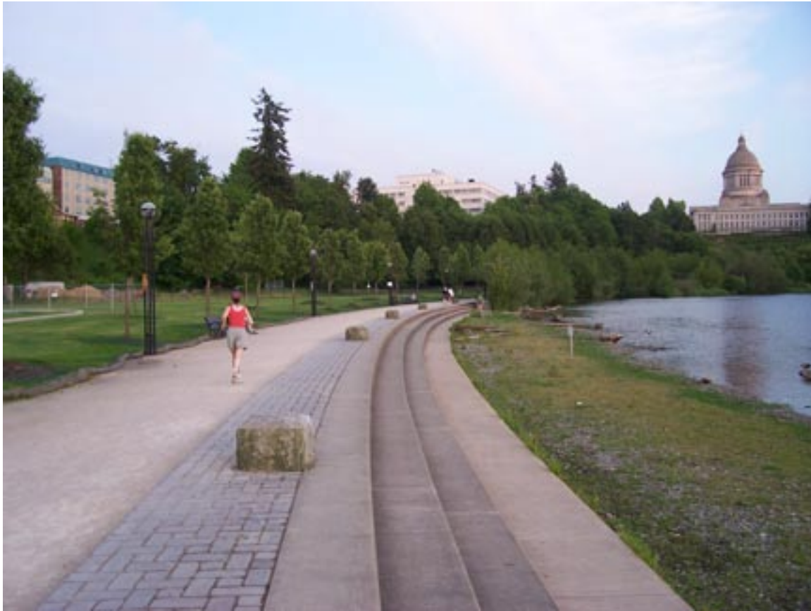
Heritage Park Arc of Statehood Trail: People can be seen walking, running and bicycling around Capitol Lake almost every day of the year.