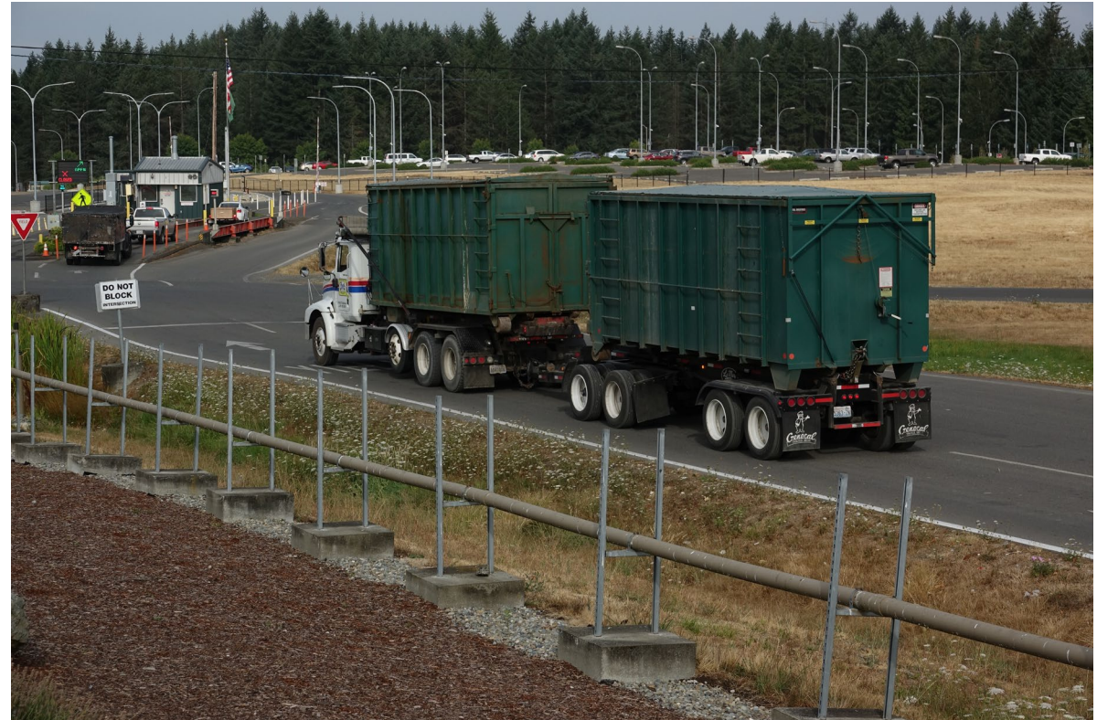
Truck transporting waste to the Roosevelt Landfill.

Thurston County provides citizens with efficient, reliable, and affordable solid waste collection, handling, recycling and disposal services.