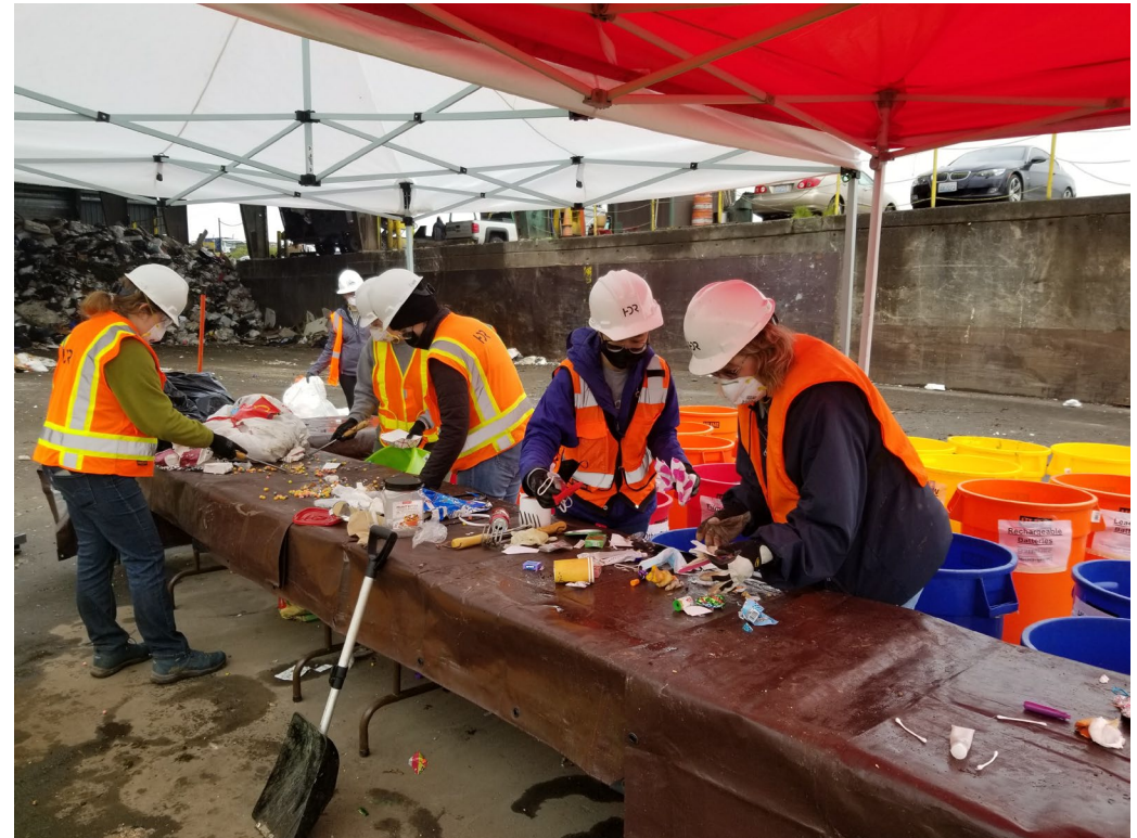
Waste sort at the Waste and Recovery Center.

Regulatory Requirements Solid Waste Management Plan Recycling Markets Waste Characterization Studies Advisory Committees County Strategic Plans Population Growth