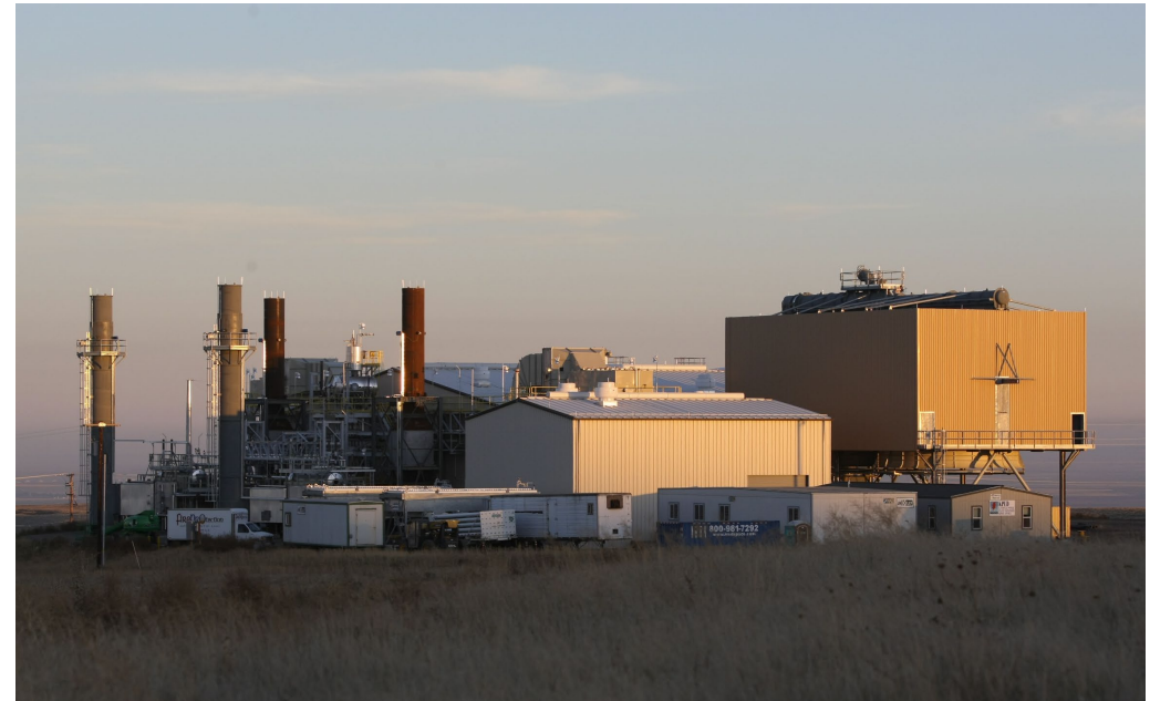
Power plant at Roosevelt Landfill.