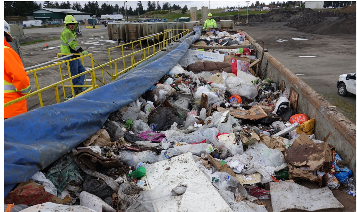
Garbage being prepared for transport at the Waste and Recovery Center.