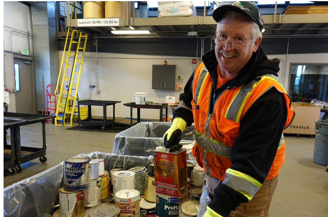
Household hazardous waste is managed at the HazoHouse.